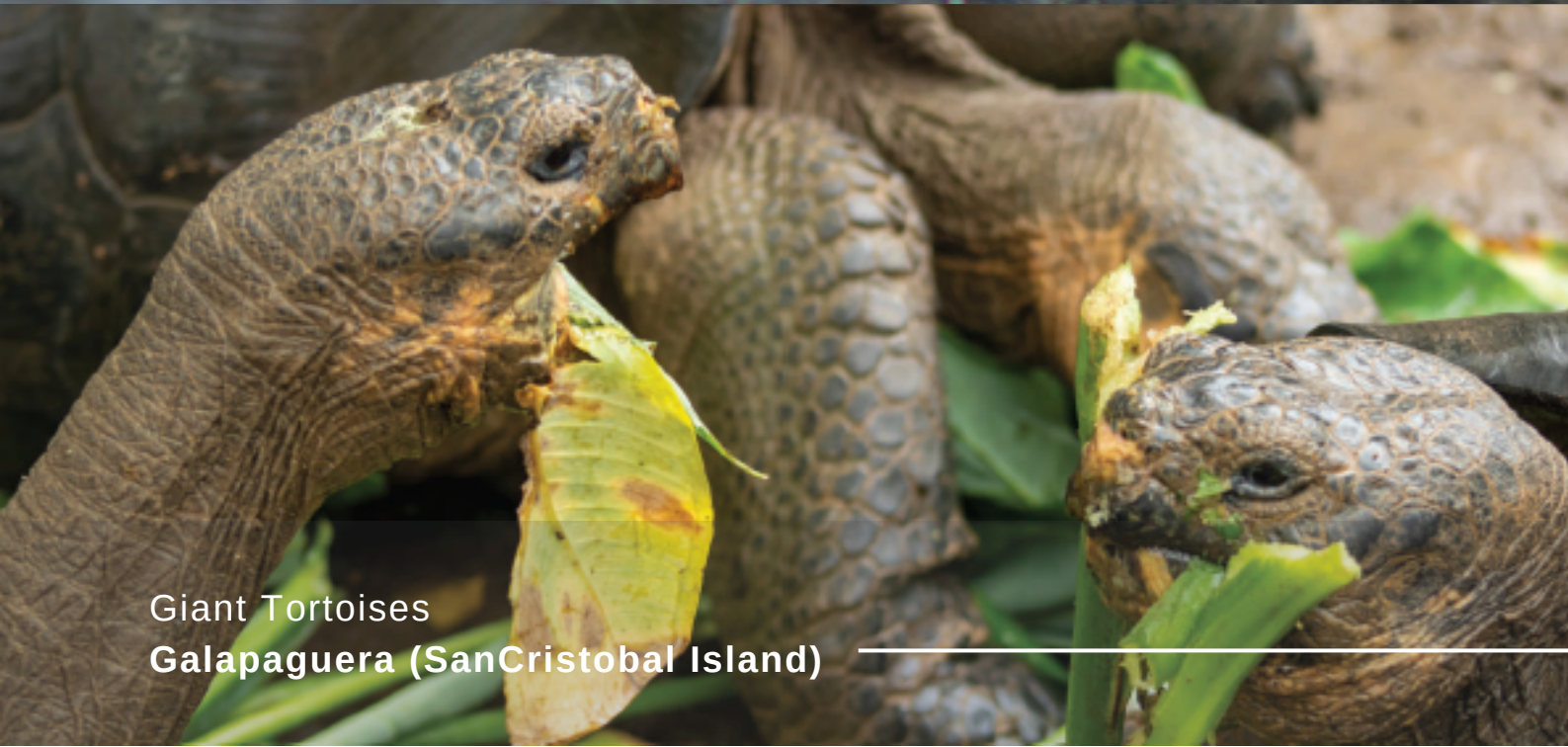
Giant Tortoises Galapaguera (SanCristobal Island)