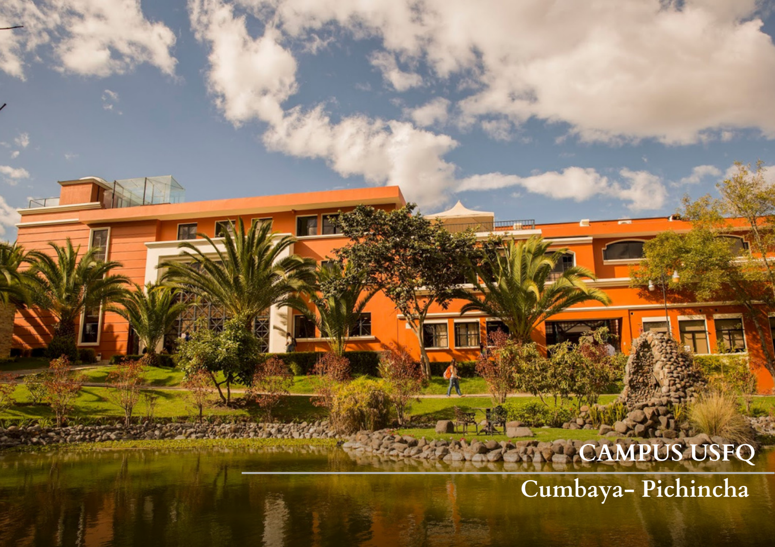
CAMPUS USFQ Cumbaya- Pichincha