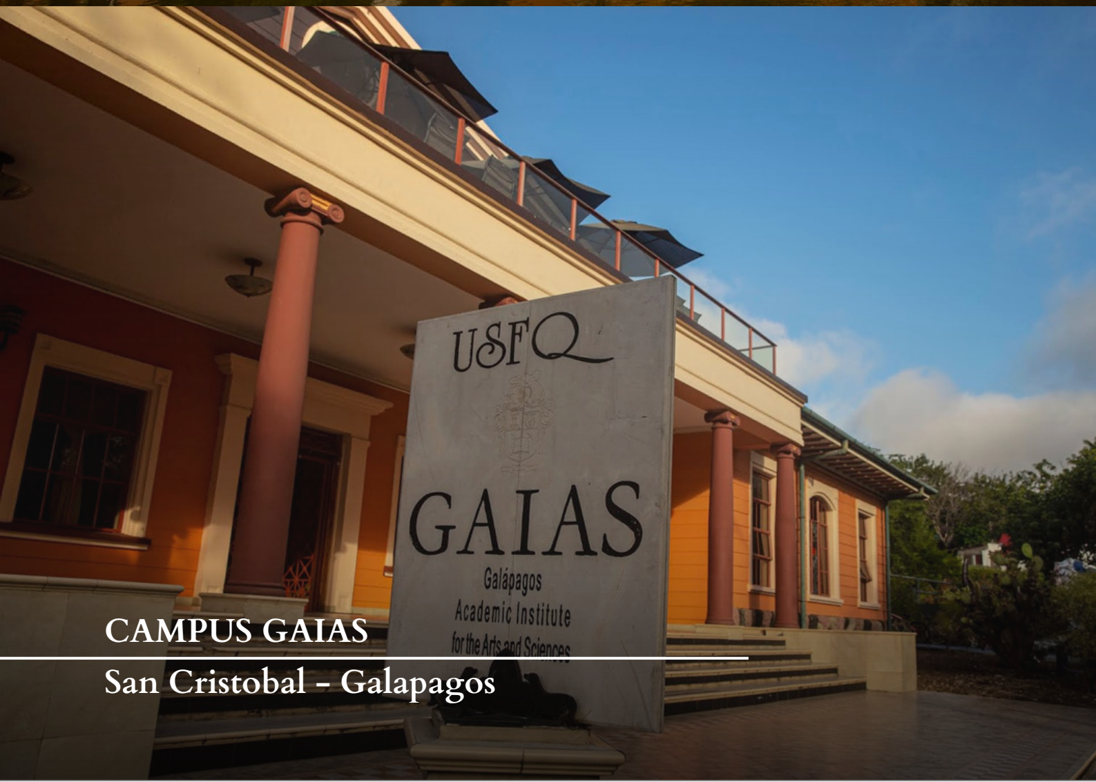
CAMPUS GAIAS San Cristobal - Galapagos