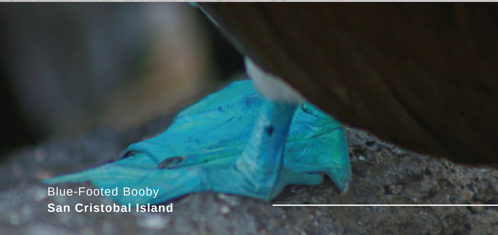
Blue-footed Booby San Cristobal Island