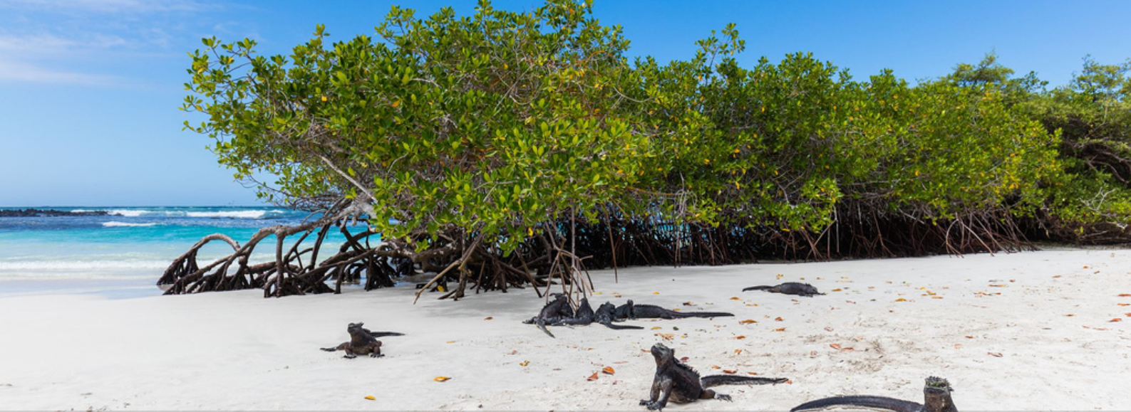
Marine Iguanas Tortuga Bay (Santa Cruz Island)